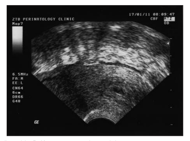
FIGURE 2: A. Before local methotrexate treatment of cervical pregnancy with cardiac activity, B. After treatment complete resolution.

cated normal pregnancy; due to distortion from uterine fibroids, contractions or anomalies, may be confused with a cornual one. A more specific finding is the sign of interstitial line, which represents "an echogenic line that extends into the upper regions of the uterine horn and borders the margin of the intramural gestational sac". The diagnosis usually delays because of the distensibility of the myometrium at this site and usually the patients apply the clinics with a complaint of amenorrhea, abdominal pain or anormal vaginal bleeding at 7-12 gestational weeks.