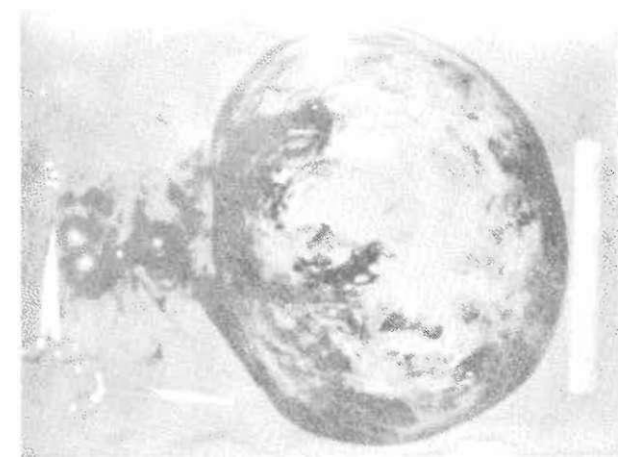
Figure 1. Macroscopic appearance of the musinous cyst and other ovary.

Şekil 1. Müsinöz kistin ve diğer överin makroskopık görünümü