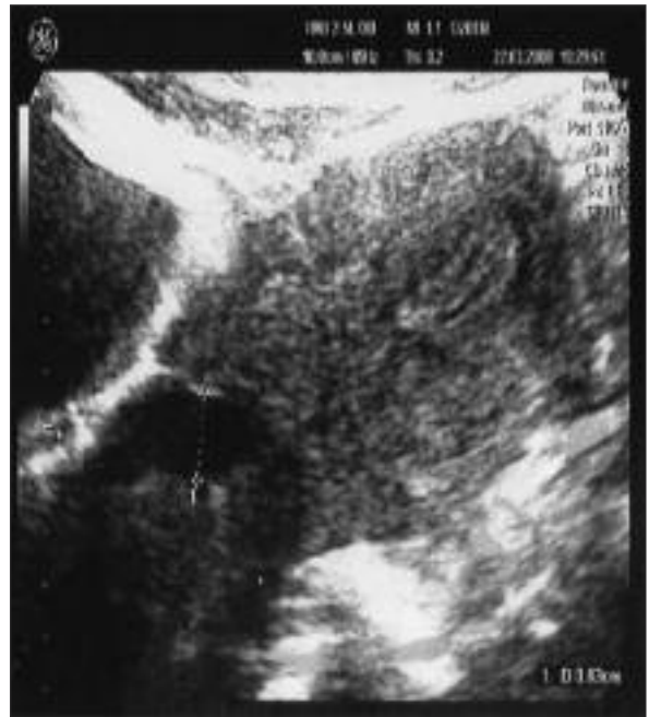
FIGURE 2: Sonographic view of the lesion.

the operation, a Pfannenstiel-type skin incision was preferred. During the exploration, an area that was approximately 1 cm in length was seen on the place which was consistent (compatible) with a prior cesarean section scar that befit at the junction of isthmic segment and uterine corpus, and the underlying cavity was covered solely by serosal layer (Figure 3). After the urinary bladder blunt dissection, the scar tissue was excised. Myometrium was sutured initially and be wary of not to involve endometrium, and serosa was closed afterwards. After the bleeding sites were cauterized operation was ended and the abdominal layers were closed in anatomical order. The patient was discharged from the hospital on post-operative second day. One month later the patient was evaluated with transvaginal USG and it was seen that the defect was completely closed (Figure 4).