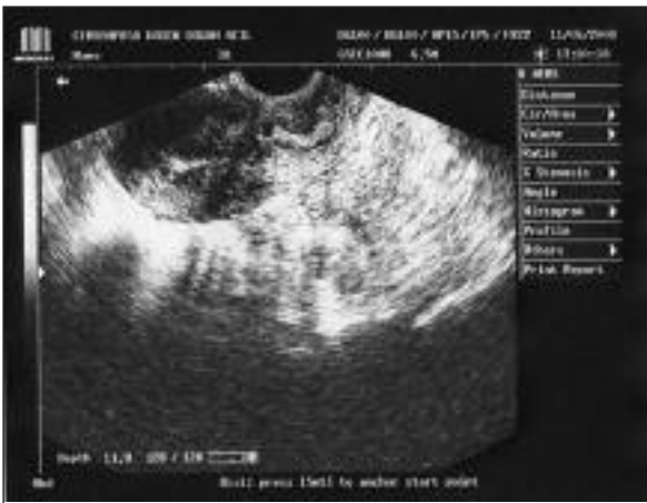
FIGURE 4: Sonographic view after surgery.

Although many incision types have been described, because of favorable surgical results, Pfannenstiel incision is preferred for cutaneous incision and Munroe-Kerr is used for uterine incision. 2 During surgery, uterus is closed with interlocking continuous sutures as a single layer. It is essential to pay attention to approximate myometrial edges suitably. In pregnancies after cesarean section, complications such as uterine rupture, placenta previa/accreata, and pregnancy on prior cesarean section scar are encountered more frequently. 3-5 The defects on uterine scar tissues were an uncommon complications of the C/S. In this case, a defect was developed from the uterine scar tissue, and a diagnosis could only be made during infertility evaluation. The patient did not attend regular control visits also she had no complaint so the de-