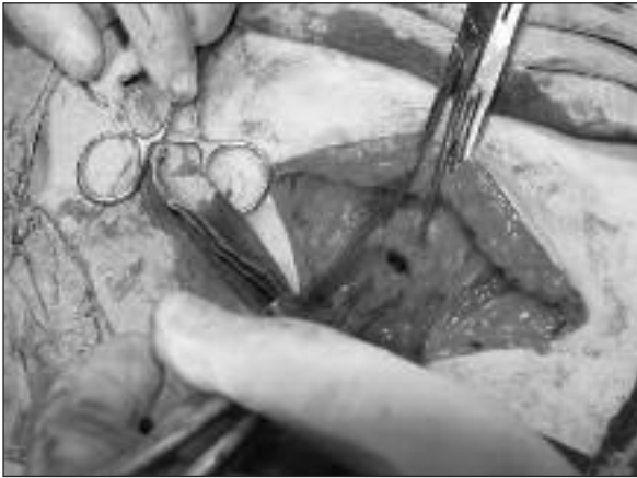
FIGURE 3: Intraoperative view of the defect.