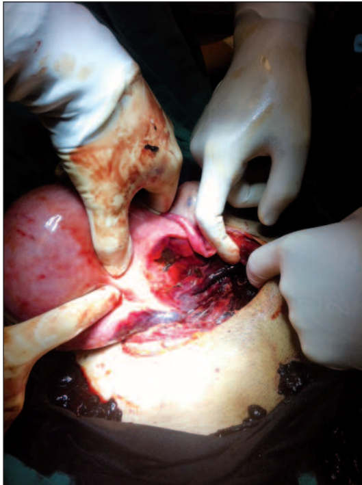
FIGURE 2: Uterine rupture from left uterine wall including vessels.

dus and repaired with one layer of suture after suction of gestational material. 7 Singh et al. and Kahyaoglu et al. previously reported uterine rupture cases with uterine anomaly in the first trimester. 8,9 Tola presented a case at 12 weeks of gestation with bicornuate uterus. In this case 2 cm fundal uterine rupture in the left part of the uterus was repaired. 10 In our case, there were no any obvious risk factor.