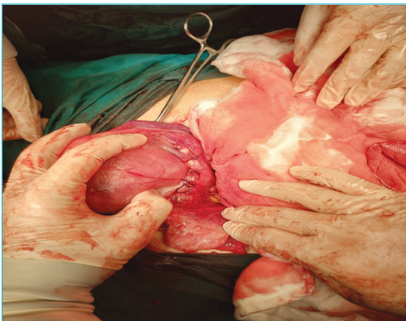
FIGURE 2: Rupture area after the repair.