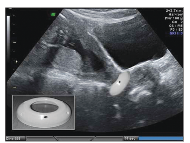
FIGURE 3: Cervical pessary.

- Although the classical recommendation is cervical cerclage for short cervix detected before 24-26 weeks in women already using 17-OHPC, continu-