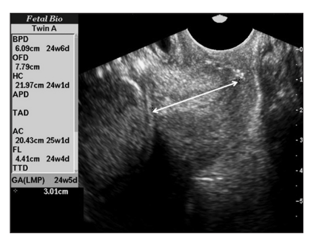
FIGURE 1: Cervical length measurement by transvaginal ultrasonography (TVUSG). Measurement technique:

If possible, cervical length measurement by transvaginal ultrasonography (TVUSG) is recommended for all pregnant women, especially for those in the risk group at the time of the second trimester fetal anatomic scan at 18-24 weeks (Figure 1, Table 2). A measurement of <25 mm is considered as a short cervix. If TVUSG cannot be performed, evalu-