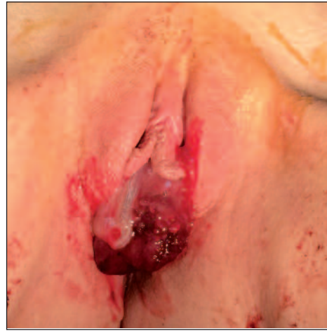
FIGURE 1: Fragile reddish mass was protruding to the vaginal introitus at 22. weeks of gestation.

Postoperative course was uneventful. The next day, the funnelling of the cervical canal disappeared. The histopathologic findings revealed no evidence of malignancy in the polyp. Microscopic