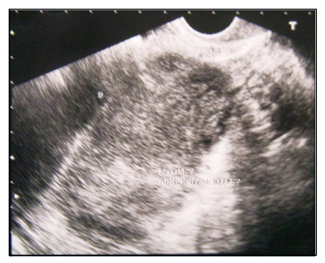
Figure 1. The ultrasonographic view of appendix mucocel.

Mucocele of the appendix is a relatively uncommon pathology with a reported incidence of